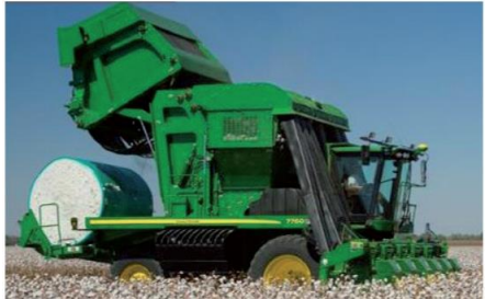
Figure 2. Approximately 23ft 4in long and 7.11m high